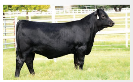
EXAR Lucy 4642 »» Daughter of RSA True Balance 1311