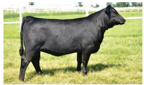
EXAR Rita 3622 »» Full Sister to EXAR Cash 3622B