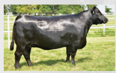
EXAR Elba 9501 »» Dam of EXAR Bedlam 2936B