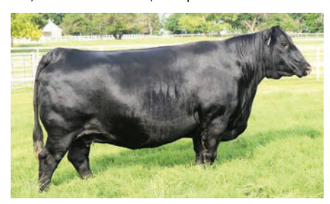
Basin Joy 9140 »» Dam of Basin Jameson 1076