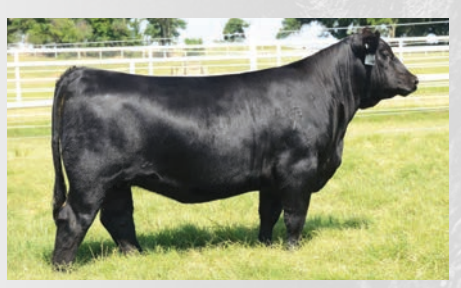
EXAR Henrietta Pride 3782 »» Daugther of Basin Jameson 1076