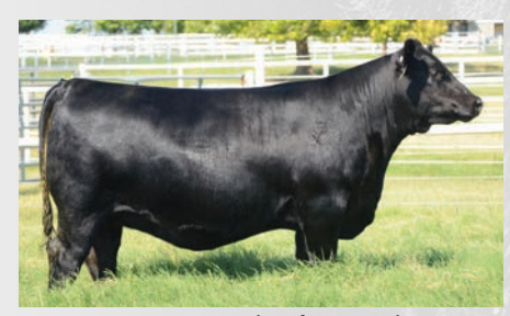
EXAR Erianna 3609 »» Daughter of RSA True Balance 1311