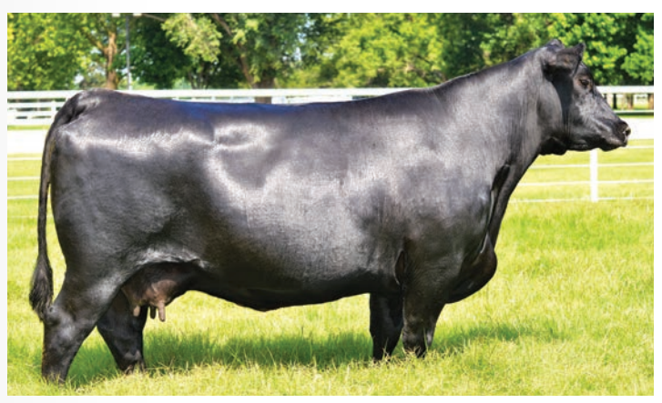
2 Bar GAdvance 5134 »» Dam of EXAR Lifeline 2621B