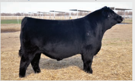
EXAR Safeguard 2141B »» Son of EXAR Vanguard 0614B