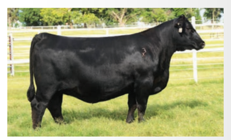
EXAR Elba 3645 »» Daughter of EXAR Stock Fund 9097B