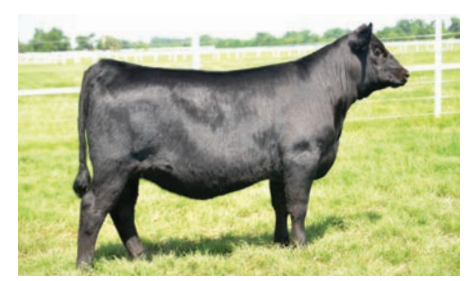
EXAR Rita 1285 »» Daughter of EXAR Stock Fund 9097B