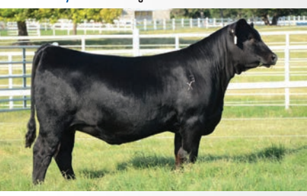
EXAR Blackcap 3811 »» Daughter of RSA True Balance 1311