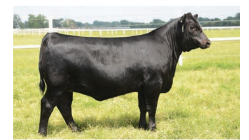
EXAR Lucy 4614 »» Daughter of RSA True Balance 1311