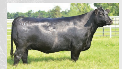
Chair Rock Sure Fire 6095 »» Dam of EXAR Tomahawk 2836B

Riverbend Ranch in the 2023 Spruce Mountain Ranch Sale; Linda 2806, the $280,000 valued half interest selection of Pollard Farms; and Linda 1601, the $170,000 co-top-selling open heifer of the 2022 Spruce Mountain Ranch Sale selected by AAA Farms; a flush selling to Vintage Angus Ranch in the 2021 Express Ranches Sale for $150,000; Linda 1884, the $130,000 selection of Riverbend Ranch in the 2022 Express Ranches Big Event; a $60,000 top-selling heifer pregnancy in the 2021 Bases Loaded Sale selected by AAA Farms; and a $40,000 heifer pregnancy selected by RS Angus in the record-setting 2023 Big Event.