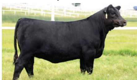
EXAR Isabel 4612 »» Daughter of EXAR Cover The Bases 0819B