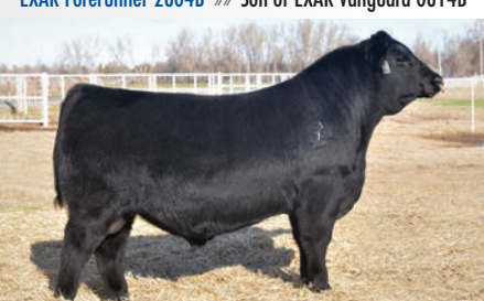
EXAR Spearhead 2611B »» Son of EXAR Vanguard 0614B