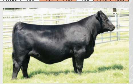
EXAR Lucy 3174 »» Daughter of EXAR Stock Fund 9097B