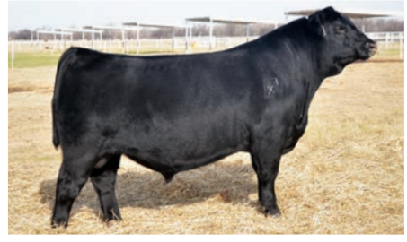
EXAR Garrison 2109B »» Son of EXAR Vanguard 0614B