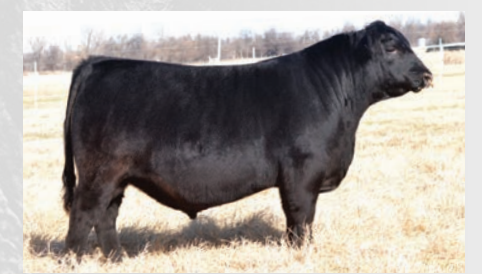
EXAR Closer 3646B »» Son of EXAR Cover The Bases 0819B