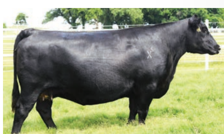
EXAR Rita 8713 »» Dam of EXAR Cash 3622B