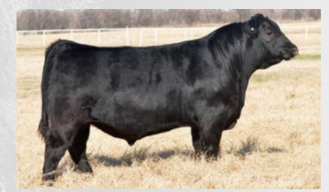
EXAR Equity Fund 3637B »» Son of EXAR Perfecto 1124B