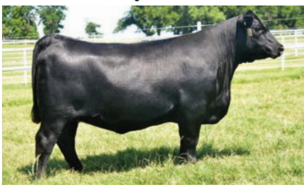
EXAR Blackcap 2619 »» Daughter of EXAR Stock Fund 9097B