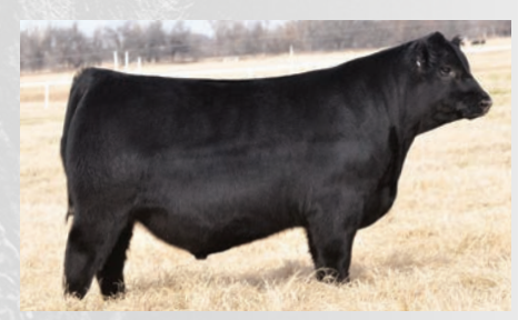
EXAR Log In 3062B »» Son of EXAR Vanguard 0614B