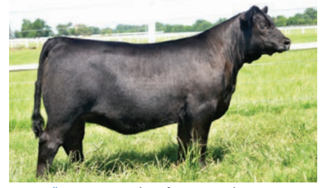
EXAR Elba 3611 \, »» Daughter of EXAR Cover The Bases 0819B