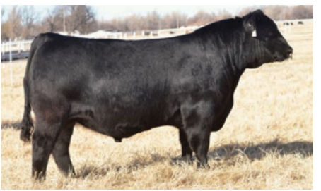
EXAR Complete 3620B »» Son of EXAR Perfecto 1124B