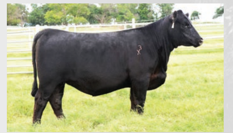
EXAR Rita 3914 »» Full Sister to EXAR Cash 3622B