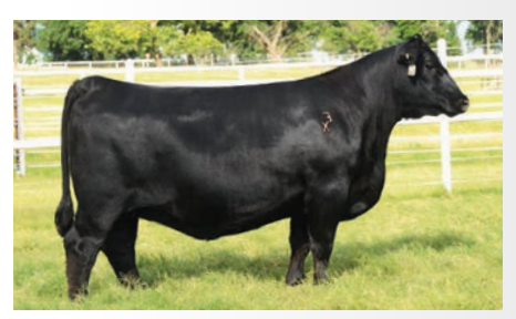
EXAR Elba 3645 »» Maternal Sister to EXAR Bedlam 2936B