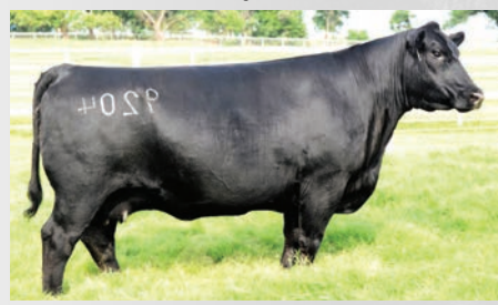
RSA Forever Lady 9204 »» Dam of RSA True Balance 131