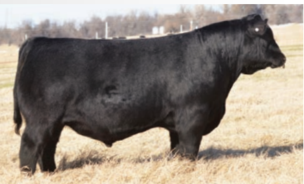
EXAR Resolution 3343B »» Son of EXAR Perfecto 1124B