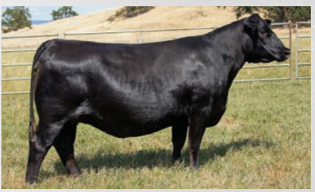
RMKR Rita 0237 »» Dam of FF Rito Ambitious