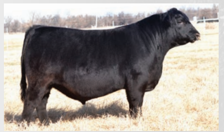
EXAR Closer 3646B »» Maternal Brother to EXAR Bedlam 2936