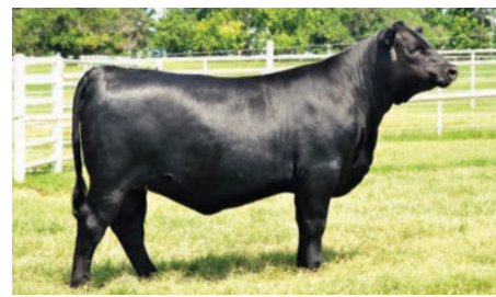
EXAR Linda 2851 »» Materna Sister to EXAR Tomahawk 2836B