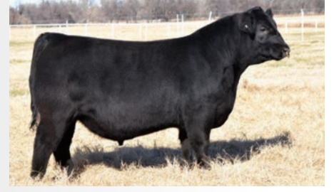
EXAR Forefront 3662B »» Son of EXAR Perfecto 1124B