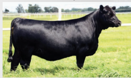
EXAR Fanny 3968 »» Daugther of Basin Jameson 1076