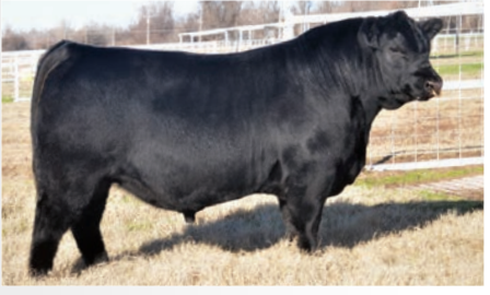
EXAR Forerunner 2604B »» Son of EXAR Vanguard 0614B