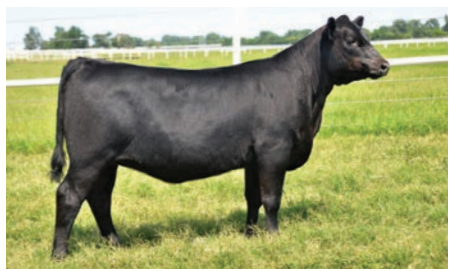
EXAR Elba 3682 »» Maternal Sister to EXAR Bedlam 2936B