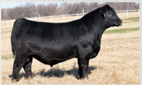
EXAR Safe Keeping 3634B »» Son of EXAR Stock Fund 9097B