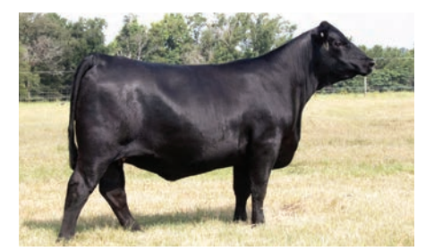
FF Rita 2B42 0237 Provider »» Maternal Sister to FF Rito Ambitious