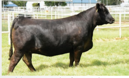
EXAR Blackcap 3012 »» Daughter of EXAR Cover The Bases 0819B