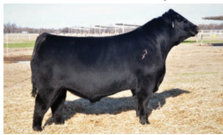
EXAR Forefront 2610B »» Son of EXAR Vanguard 0614B