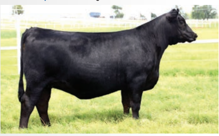
EXAR Linda 3086 »» Daughter of EXAR Cover The Bases 0819B