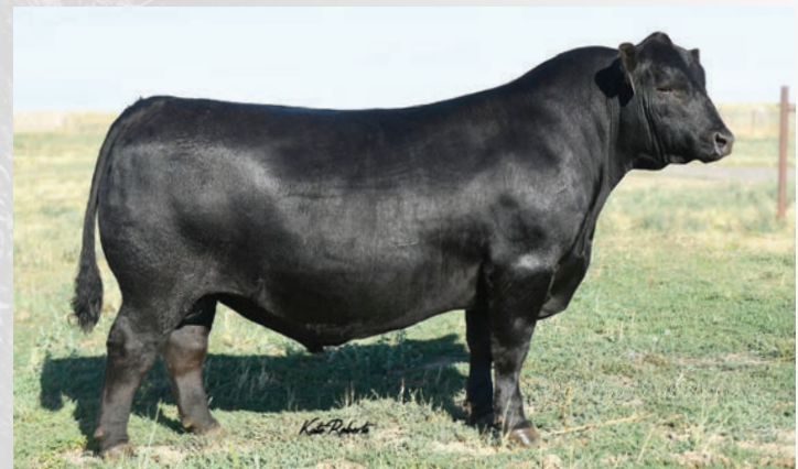
EXAR Cover The Bases 0819B »» Maternal Brother to EXAR Lifeline 2621B