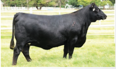
EXAR Rita 3316 »» Daugther of Basin Jameson 1076