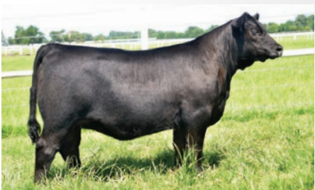
EXAR Elba 3611 »» Maternal Sister to EXAR Bedlam 2936B