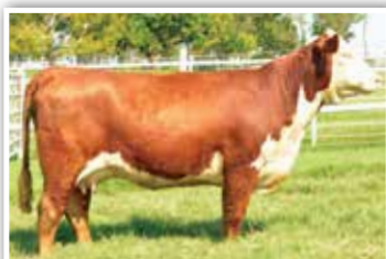
EXR Bailees McKee 0273 ET :: Daughter of 4295

This is the first time Express Ranches has made this available, so don't overlook the tremendous potential in this flush!