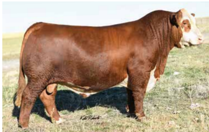
EXR Generator 0333 ET :: Full Sib to Lot 1

Top 1% $CHB, Top 2% UIMF, Top 3% $BII, Top 3% CWT, Top 5% $BMI, Top 10% UREA, Top 15% CEM, Top 15% YW, Top 20% WWV, Top 25% Milk, Top 25% Stay