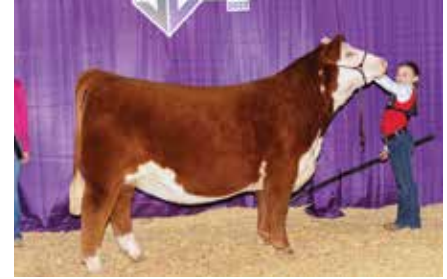
EXR Primrose 1501 ET Owned by Ella Weldon, OK Full Sib to Lot 38 Maternal Sib to Lots 37, 39 & 40