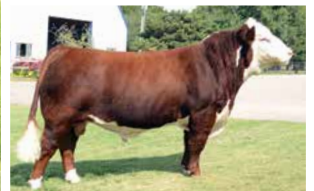
RW DM Remington 734 4035 Sire of Lot 30

Top 20% CEM, Top 20% UREA, Top 25% CWVT, Top 25% WW