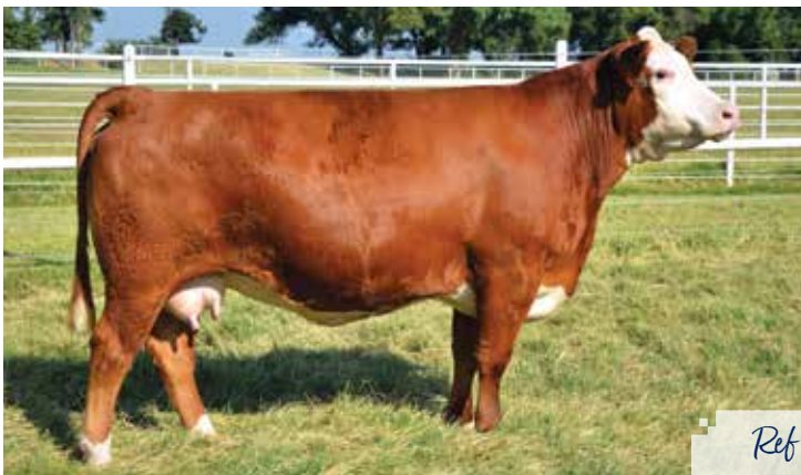
R Miss Addition 2569 :: Dam of Lot 88A & 88B Embryos

Guaranteed One Pregnancy if put in by a Certified Embryologist