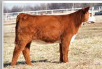
EXR Bailees McKee 2306 ET :: Daughter of 4295