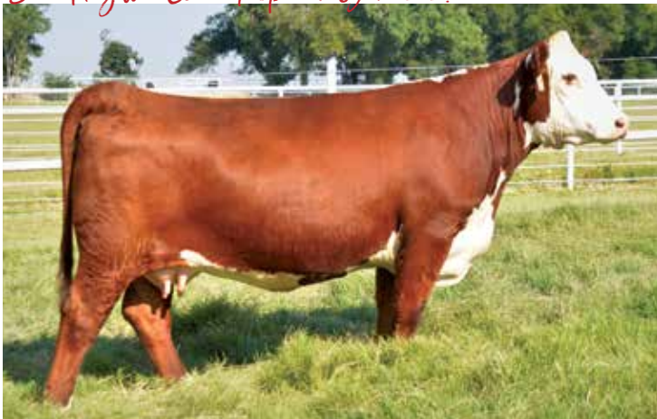
EXR Bailees McKee 0337 ET :: Full Sister to Lot 72 • Sells as Lot 1