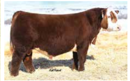
Churchill Desperado 029H Sire of Lots 10 & 11

Top 2% WW, Top 5% YW, Top 10% CWT, Top 15% $CHB, Top 20% $BII, Top 20% UIMF, Top 25% SC