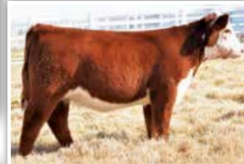
EXR Bailees McKee 0306 ET :: Daughter of 4295