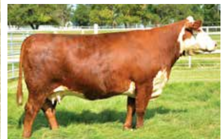
EXR Oksana 8235 ET Dam of Lot 86 & Sells as Lot 36

Maternal sister sells as Lot 82. Dam sells as Lot 36. Top 15% $CHB, Top 15% UIMF, Top 20% DMI