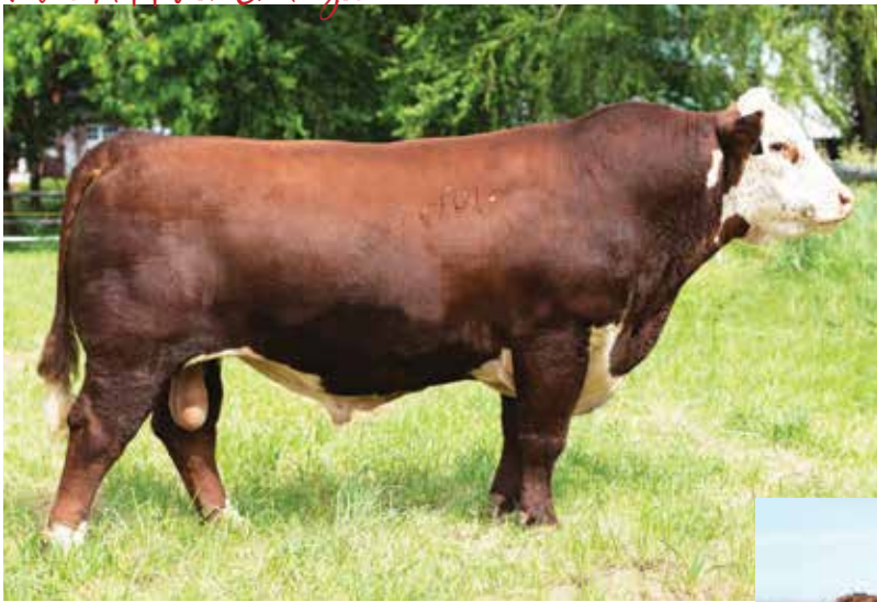
Birdwell Vanguard 5022 9337 :: Sire of Lot 88A