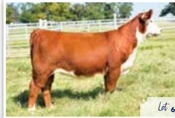
EXR Bailees McKee 3223 ET :: Daughter of 4295