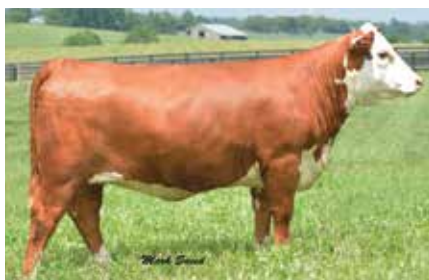
Boyd Dew Drop 3304 Dam of Lots 31 & 32

Top 4% UREA, Top 10% $BII, Top 10% $BMI, Top 10% DMI, Top 15% $CHB, Top 15% Stay, Top 20% TEAT