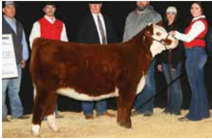
EXR Val 0219 ET Dam of Lot 83