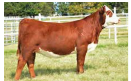
EXR Valedictorian 2048 ET Dam of Lot 11

Top 3% WW, Top 4% $BII, Top 5% $CHB, Top 5% CWT, Top 5% YW, Top 10% $BMI, Top 10% UIMF, Top 15% Stay, Top 15% UDDER, Top 20% CEM, Top 20% Milk, Top 20% TEAT, Top 25% SC