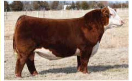
CH High Roller 759 ET Sire of Lots 6, 7 & 9