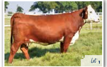
EXR Bailees McKee 0337 ET :: Daughter of 4295