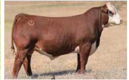
SHF Houston D287 H086 Service Sire to Lot 85

Top 3% CWVT, Top 4% UDDER, Top 5% TEAT, Top 10% $CHB, Top 10% CEM, Top 10% Milk, Top 10% UREA, Top 10% WWV, Top 10% YW, Top 15% CED, Top 25% SC