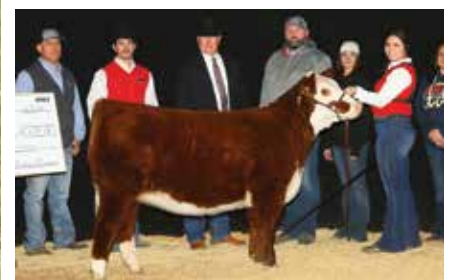
EXR Val 0219 ET Dam of Lots 14 & 15

Full sister sells as 14 and maternal sister sells as Lot 83. Top 10% WW, Top 15% YW