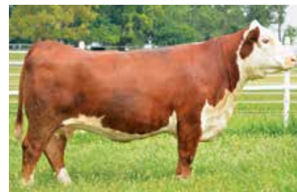
EXR Primrose 4126 ET Dam of Lots 37, 38, 39 & 40