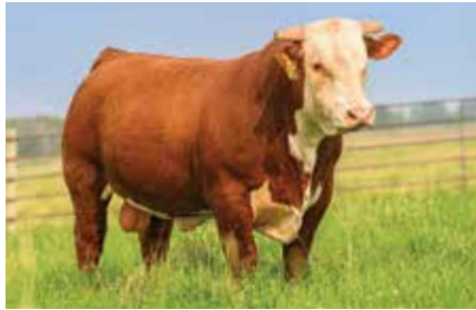
Churchill Roughneck 0280H Service Sire to Lots 29, 31 & 32

Full sister sells as Lot 32 and maternal sisters sell as Lots 12, 13, 49, 58, and 77. Top 1% $BMI, Top 2% $BII, Top 2% Stay, Top 4% Milk, Top 5% TEAT, Top 10% $CHB, Top 15% UDDER, Top 20% CED, Top 20% CWV, Top 20% UIMF, Top 20% UREA, Top 20% VVV, Top 25% CEM, Top 25% YV