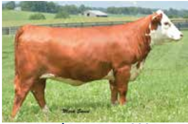
Boyd Dew Drop 3304 Dam of Lot 49

Bred with Production and Phenotype in Mind!