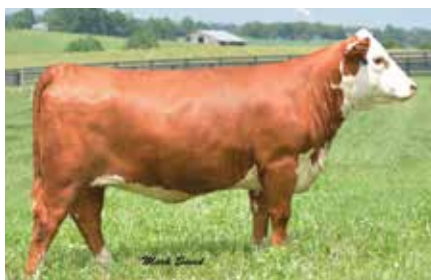
Boyd Dew Drop 3304 Dam of Lots 12 & 13

Top 3% $CHB, Top 4% CVWT, Top 5% SC, Top 10% UIMF, Top 15% $BII, Top 15% CEM, Top 15% WW, Top 15% YW, Top 20% Milk, Top 20% UREA, Top 25% $BMI, Top 25% BVV