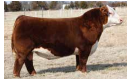
CH High Roller 756 ET Sire of Lots 14, 15 & 16

Full sister sells as 15 and maternal sister sells as Lot 83. Top 10% WW, Top 15% YW