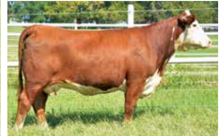
EXR Dani 7200 ET Dam of Lots 27, 28 & 29

Top 1% $BMI, Top 1% Stay, Top 3% $BII, Top 4% UDDER, Top 5% TEAT, Top 10% DMI, Top 25% CED, Top 25% UFat