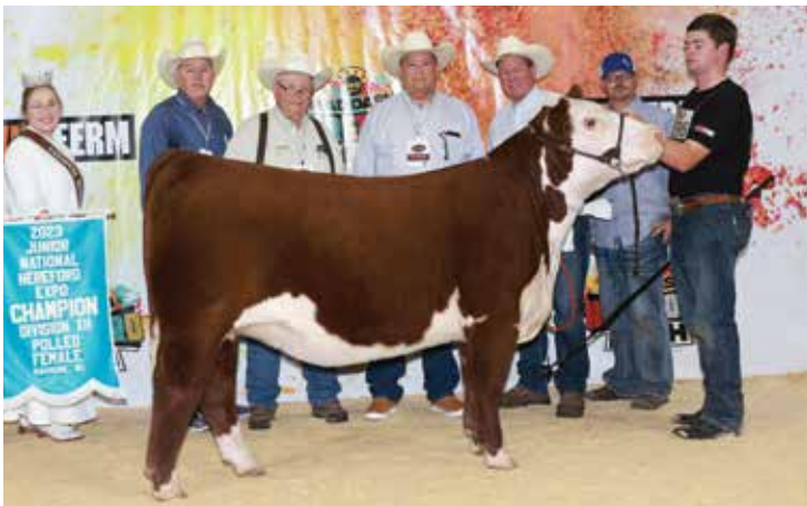
EXR High Class Kat 2218 ET :: Maternal Sister to Lots 4 & 5

Top 4% UREA, Top 10% Milk, Top 15% WW, Top 15% YW, Top 20% CVWT, Top 25% SC, Top 25% UFat