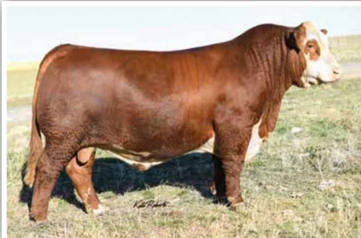
EXR Generator 0333 ET :: Son of 4295