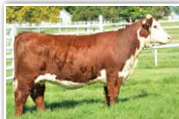
EXR Bailees McKee 1288 ET :: Daughter of 4295