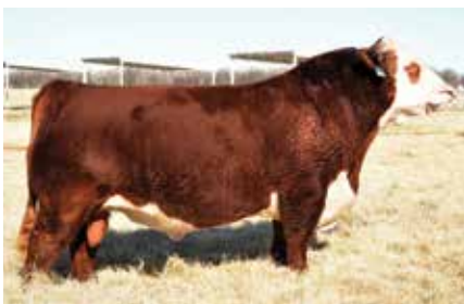
EXR Bankroll 8130 ET Sire of Lot 17