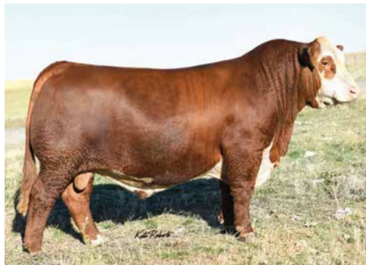
EXR Generator 0333 ET :: Sire of Lot 66A

Top 10% $BII, Top 10% $BMI, Top 10% Stay, Top 10% WWV, Top 15% YW, Top 20% CWT, Top 25% CED, Top 25% SC