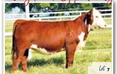
EXR Bailees McKee 3225 ET :: Daughter of 4295