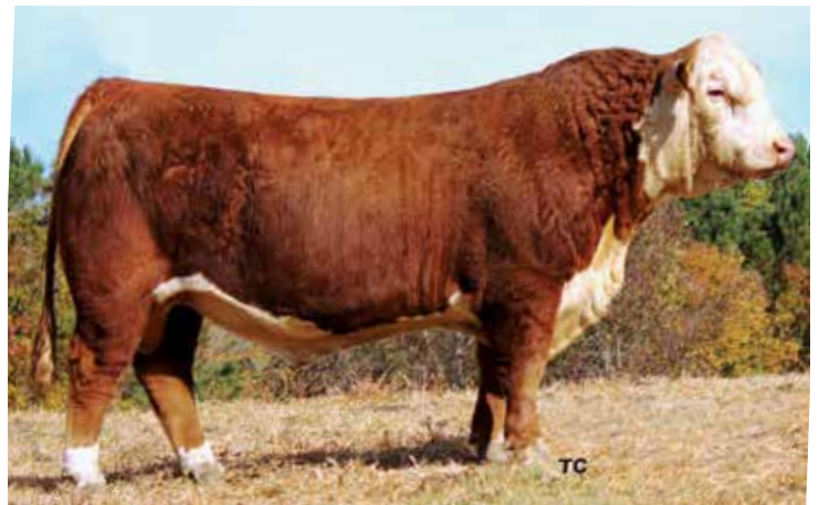
Innisfail WHR X651/723 4013 ET :: Sire of Lots 3A & 3B