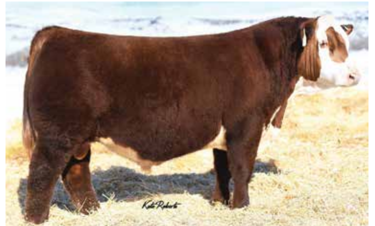
Churchill Desperado 029H :: Sire of Lot 51

Powerfully built Genesis daughter that is balanced with body, muscle shape and an exquisite look. She is backed by the Dani 7200 donor that was an exceptional broody and good looking female and she passes those qualities on to her offspring. Maternal sisters sell as Lots 27, 28, 29, and 70.