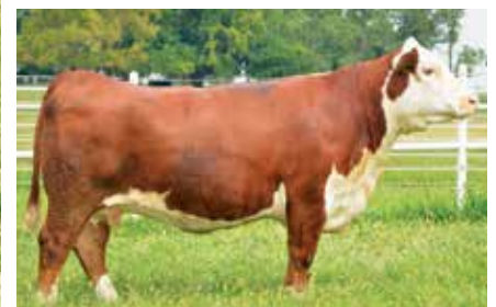
EXR Primrose 4126 ET Dam of Lots 47 & 48

Top 4% $BMI, Top 4% UREA, Top 5% SC, Top 5% Stay, Top 10% $BII, Top 10% Milk, Top 15% CWT, Top 20% $CHB, Top 20% YW, Top 25% UFat, Top 25% WWV