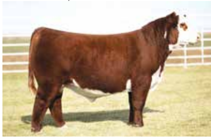
Loewen Genesis G16 ET :: Sire of Lots 12 & 13

Maternal sisters sell as lots 31 and 32. Top 1% $BII, Top 1% $BMI, Top 2% Stay, Top 4% UIMF, Top 5% $CHB, Top 10% WW, Top 10% YW, Top 15% CVWT, Top 15% UDDER, Top 20% Milk, Top 20% TEAT, Top 20% UREA, Top 25% BVV, Top 25% CED, Top 25% SC