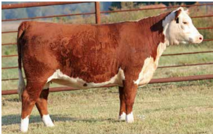
BR SHF Prime Design 5042 9345 :: Dam of Lots 3A & 3B