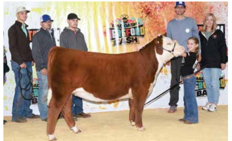
EXR High Class Kat 2324 ET :: Maternal Sister to Lots 4 & 5