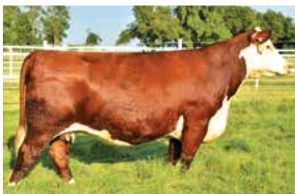
EXR Lexus 0208 ET Dam of Lot 84 & Sells as Lot 24