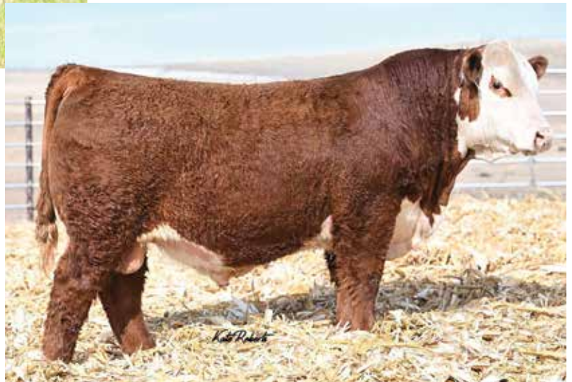
Bar JZ On Demand :: Sire of Lot 88B