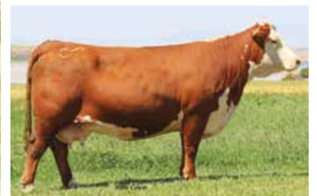
C Bailees McKee 4295 ET Dam of Lots 6, 7 & 8

Top 4% Stay, Top 10% $BII, Top 10% $BMI, Top 20% Milk, Top 20% TEAT, Top 20% UREA, Top 25% UFat