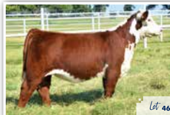
EXR Bailees McKee 3261 ET :: Daughter of 4295