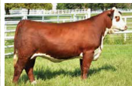
EXR Primrose 8421 Dam of Lot 23

Checked Safe to SHF HOUSTON D287 H086. Approx. due date 1/27/2024. Checkout the pigment and markings in this stoutly constructed, high volume female with an extended front one-third. Power and balance with big $ Index values and growth from the Primrose family. Top 1% $BII, Top 1% $BMI, Top 1% $CHB, Top 1% CWT, Top 2% SC, Top 2% UIMF, Top 2% YW, Top 3% Stay, Top 10% WWV, Top 15% Milk, Top 20% UREA