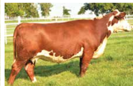
EXR Ms Dom 8420 Dam of Lot 22

Checked Safe to EXR GENERATOR 0333 ET. Approx. due date 1/5/2024. Powerfully designed female that is dark red and short marked with pigment. She is a big-bodied female with style to burn as you'd expect from a known daughter of Bankroll. This is the front pasture kind. Top 4% SC, Top 5% Ufat, Top 10% VVV, Top 15% Milk, Top 15% YW, Top 20% UREA