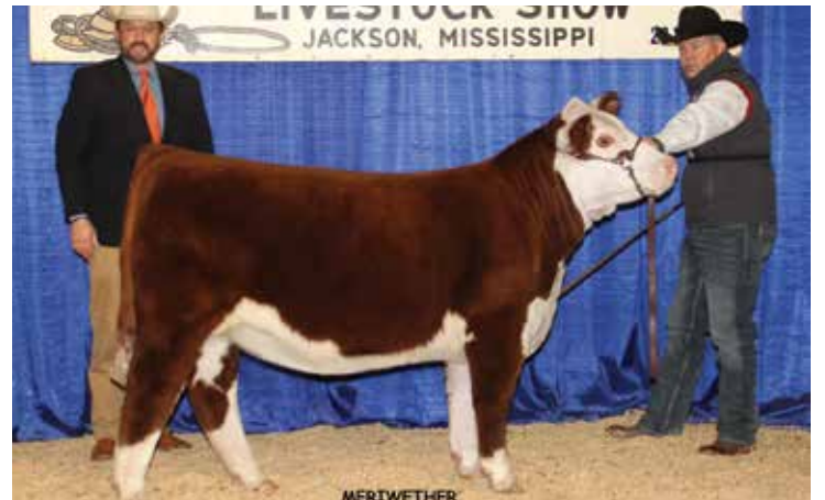
KOLT TR High Class Kat 2220 ET :: Dam of Lots 4 & 5