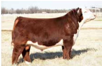
EXR Platinum 9200 ET Sire of Lots 37, 39 & 40