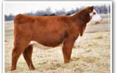
EXR Bailees McKee 2307 ET :: Daughter of 4295