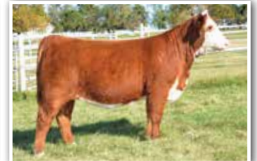
EXR Bailees McKee 0342 ET :: Daughter of 4295