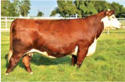
EXR Lexus 0208 ET :: Dam of Lot 16 Sells as Lot 24