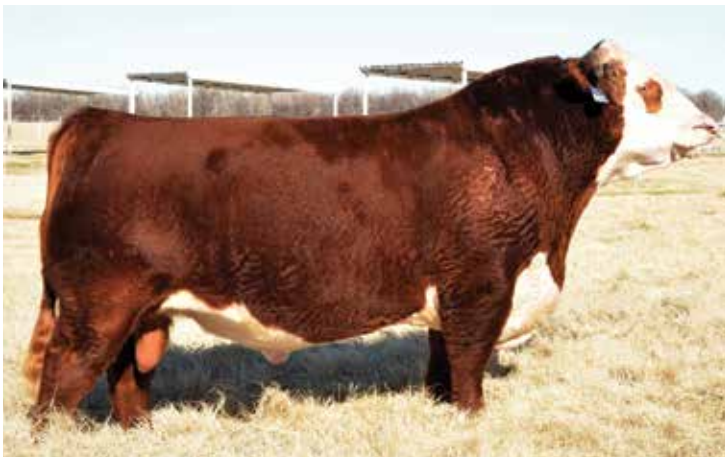
EXR Bankroll 8130 ET :: Sire of Lots 4 & 5