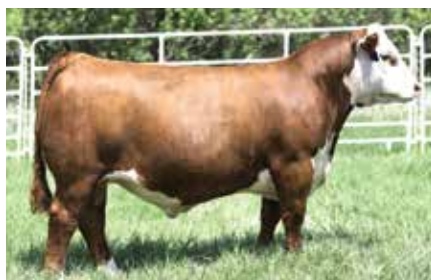
RST Final Print 0016 Sire of Lot 71A