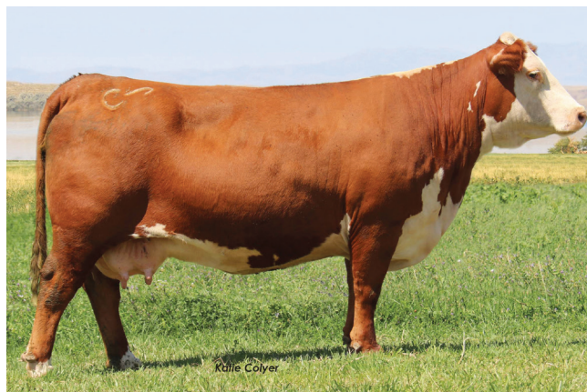
C Bailees McKee 4295 ET :: Dam of EXR Generator 0333 ET