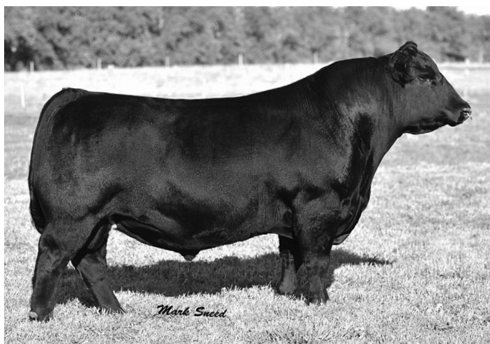
PVF INSIGHT 0129 +16805884