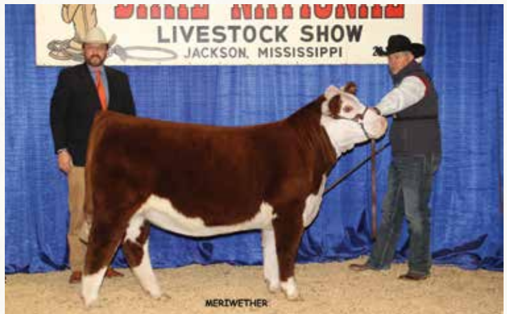
KOLT TR High Class Kat 2220 ET :: Dam of Lot 3