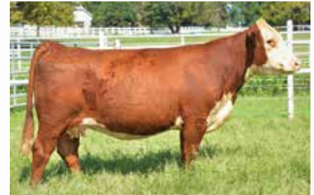
SR 6041S Celia 5040 ET Dam of Lot 79