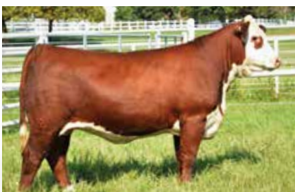
EXR Primrose 8421 Dam of Lot 22