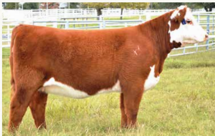
EXR Ms Dom 8108 ET :: Dam of Lot 5