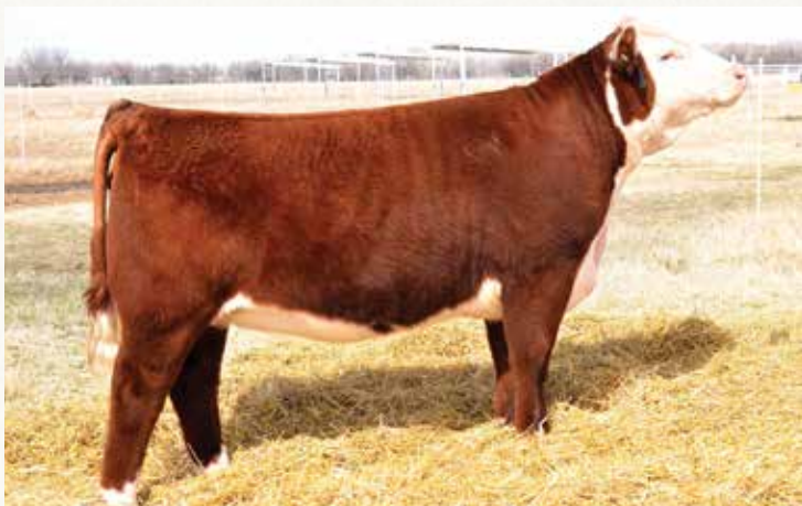
TH 40U 719T Dani 60Z :: Dam of Lot 78