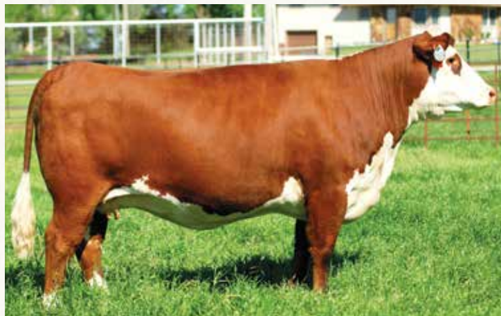
Loewen Miss On Target 10Y 1A :: Dam of Lot 7