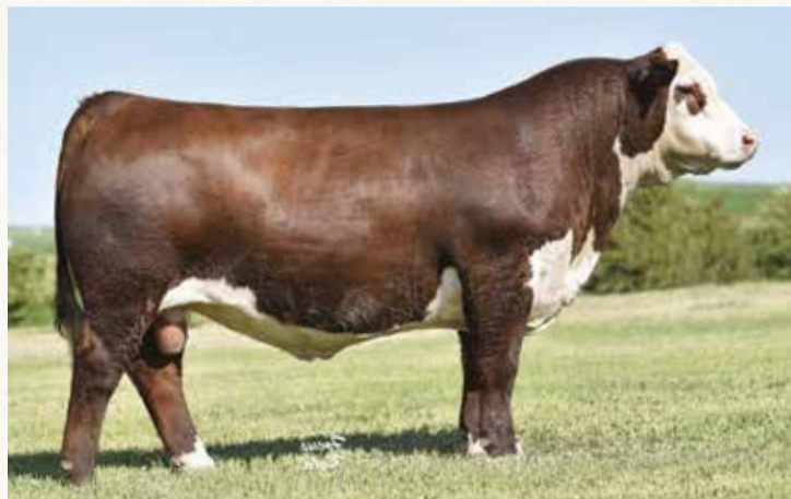
NJW 79Z Z311 Endure 173D ET :: Sire of Lots 1 & 2