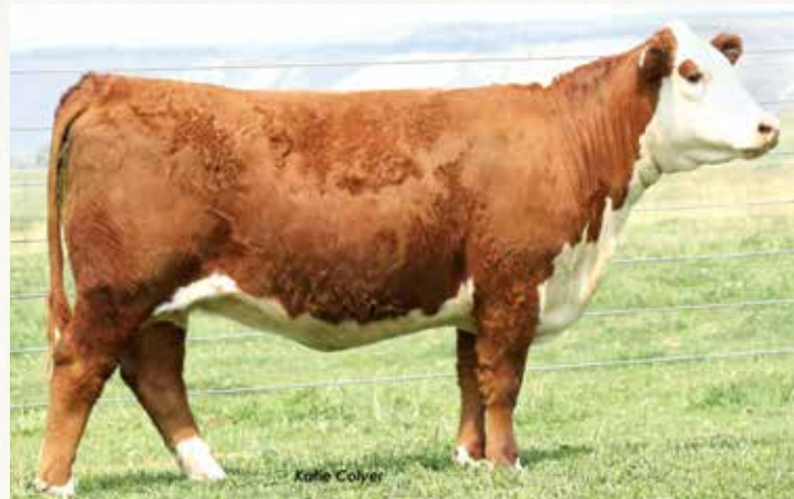
C Lady 6245 Canada 9331 ET :: Dam of Lot 6