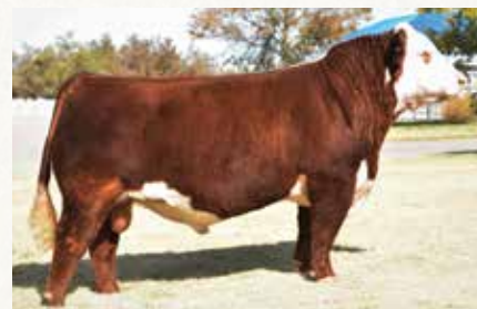
EXR Benchmark 8240 ET Sire of Lot 14