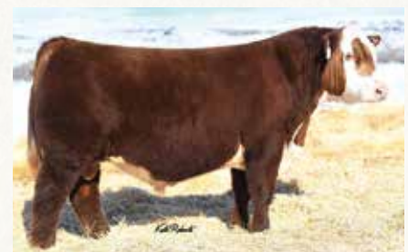
Churchill Desperado 029H Service Sire of Several Lots