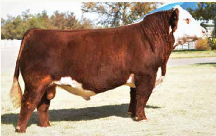
EXR Benchmark 8240 ET :: Sire of Lot 3