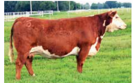
BR Terri 9130 ET Maternal Grandam of Lot 24