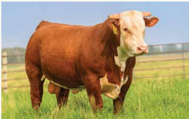
Churchill Roughneck 0280H ET :: Service sire of Lots 76 & 78