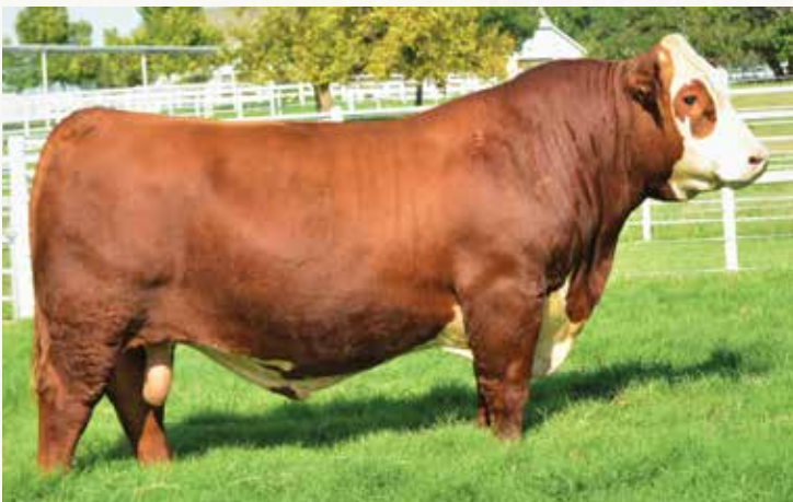
EXR Generator 0333 ET :: Maternal Sib to Lot 21