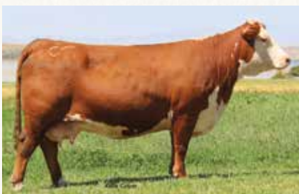
C Bailees McKee 4295 ET Dam of Lots 52 & 53