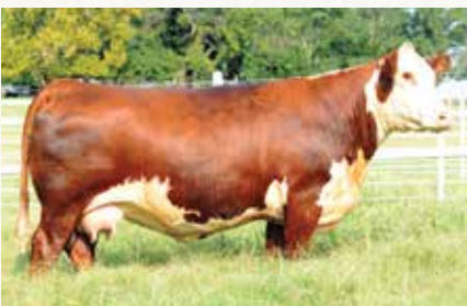
Walker Miss 4R 545 236 Dam of Lot 12