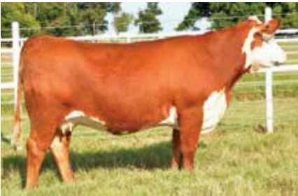
EXR Oksana 8235 ET Dam of Lot 11