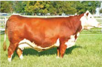
CRR 435 Kelly 166 Dam of Lot 81