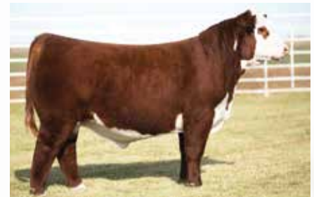
Loewen Genesis G16 ET Sire of Lots 54, 58 & 59