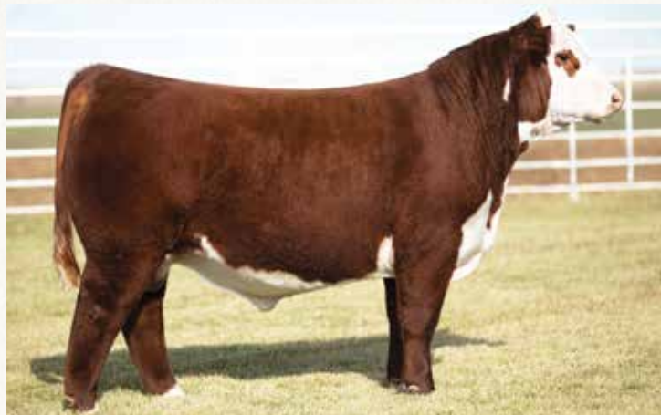
Loewen Genesis G16 ET :: Sire of Lot 7A