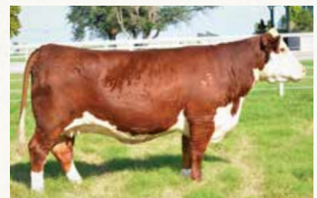
EXR Miss Lexus 4203 ET Maternal Grandam of Lot 55