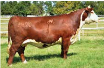
BR Validated B413 3291 6288 Dam of Lot 15