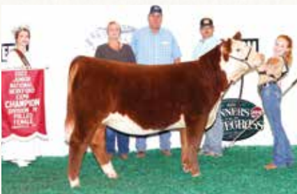
EXR Daydream 1281 Full Sister to Lots 16, 20 & 39