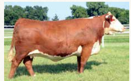
TH 618 45P Ms Dom 90W Maternal Grandam of Lot 80