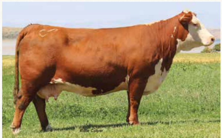
C Bailees McKee 4295 ET :: Dam of Lot 21