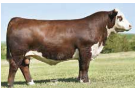
NJW 79Z Z311 Endure 173D ET Sire of Lots 52 & 53