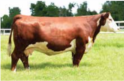
SULL TCC Ms Harley 320 ET Dam of Lot 19