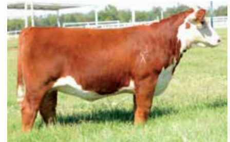
EXR Unparalleled Lass 6118 ET Dam of Lot 17