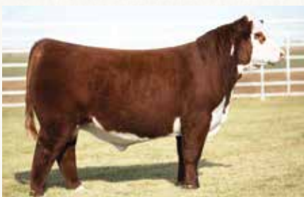
Loewen Genesis G16 ET Sire of Lots 22 & 23