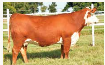
EXR Oksana 8235 ET Dam of Lot 18