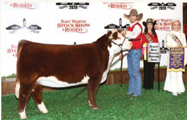
EXR High Class Kat 8249 ET :: Dam of Lot 4