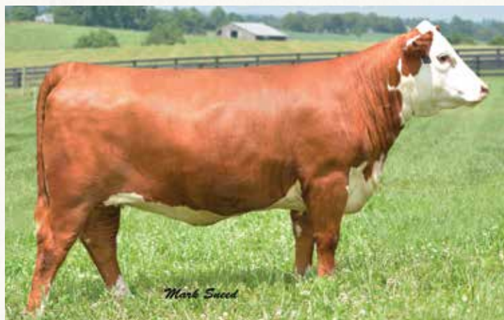
Boyd Dew Drop 3304 :: Dam of Lot 1